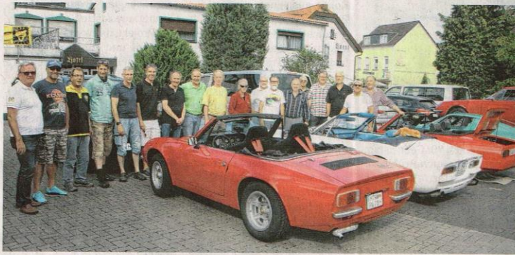
Parade der seltenen Puma-Sportwagen beim 21. Internationalen Treffen auf dem Parkplatz des Pingsdorfer „Jägerhofs“.

21. Puma-Treffen in Brühl lockte internationale Gäste an