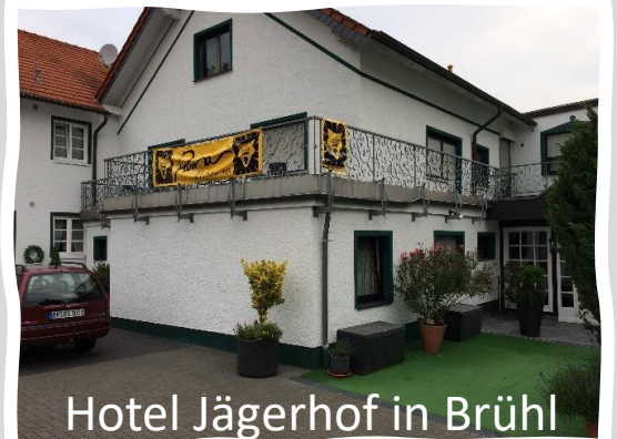
Hotel Jägerhof in Brühl

In the evening, after dinner, a few things regarding the Puma CoI Europe were discussed, and the very nice participation certificate was presented.